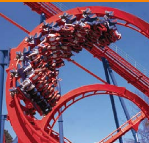
Exhibit at the upcoming IPEC conference in San Antonio, Texas, Aug. 31 - Sept. 2, 2010. <<

Reservations must be made at the hotel before August 3, 2010 to receive the conference rate of $129++.