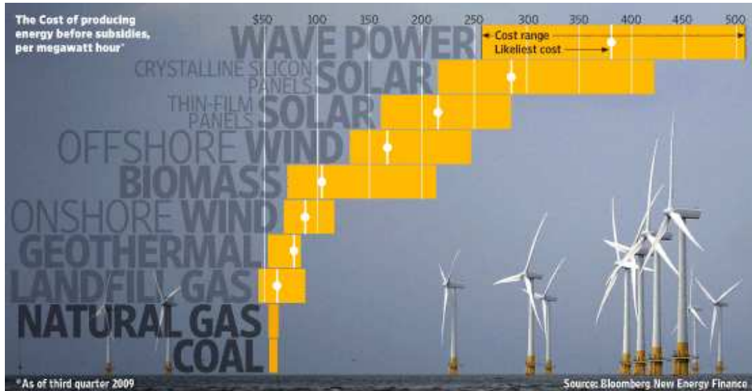
Figure 1: Relative costs of various sources of energy. 84